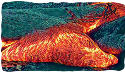
Igneous Rock forming